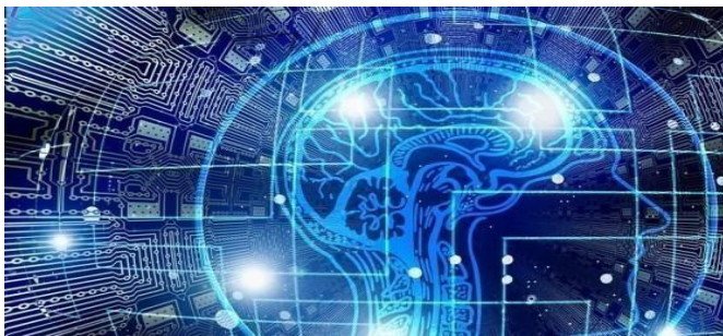
Figure 2: Artificial intelligence.

healthcare delivery to improve the health and well-being of people and communities around the world.